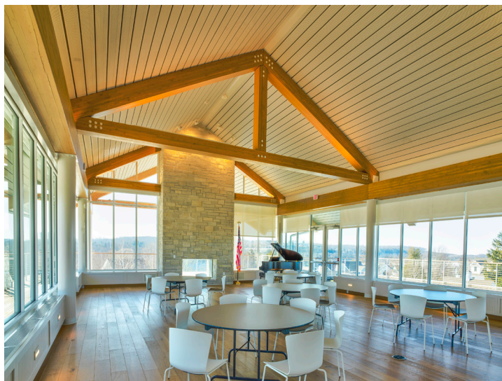
Donald & Carol Kress Pavilion

Fox Cities Exhibition Center, Appleton The New Year saw the opening of the Fox Cities Exhibition Center, a $32 million addition to Appleton. Space at this center can be divided into three 10,000 square foot sections. There's an additional 17,000 square feet of outdoor exhibition space as well.