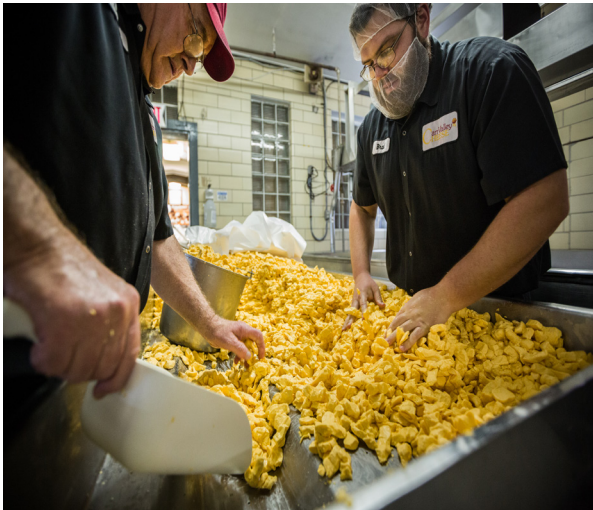
Carr Valley Cheese Company