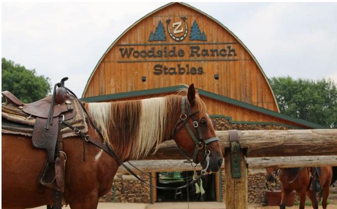
Woodside Ranch & Conference Center

Kemper Center in Kenosha is a historical venue located along the Lake Michigan shoreline. The center provides a wide choice of settings from small meeting rooms to halls accommodating up to 200, and tented events seating up to 500.