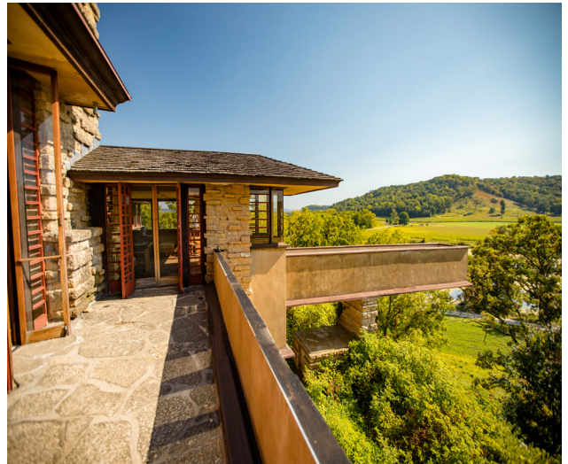
Taliesin on the Frank Lloyd Wright Trail

Appleton's Harry Houdini, pushed the limits in his quest for the ultimate illusion as a magician, escapologist and stunt performer. The amazing man from Appleton died on Oct. 31, 1926, from complications of a burst appendix at age 52. His life and illusions are immortalized at the famous History Museum at the Castle in Appleton.