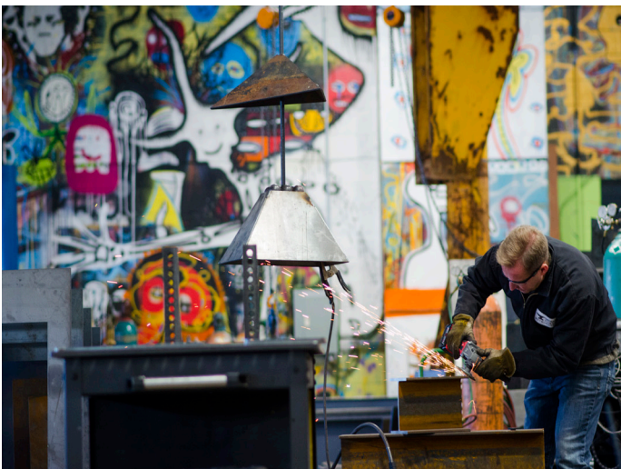
Artisan Forge Studios