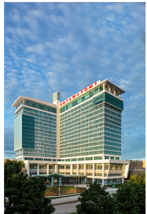
Potawatomi Hotel & Casino