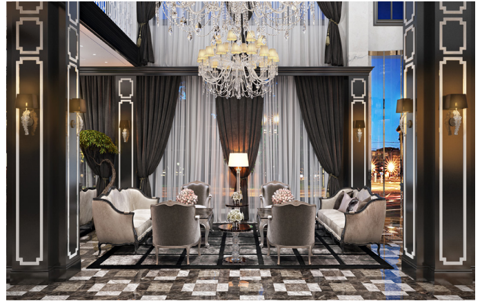
Hotel Retlaw's Grand Lobby

Hotel Retlaw, Fond du Lac Late 2018 will see the reopening of Fond du Lac's iconic hotel, the Hotel Retlaw, located in the heart of Fond du Lac's resurgent downtown district. The $24 million renovation adds 127 guest accommodations, multiple on-site dining venues, a spa, and 10,000 square feet of dedicated event space. The hotel originally opened in 1923 and was designed by Walter Schroeder, a Wisconsin hotel and insurance magnate. It's on the National Register of Historic Buildings.