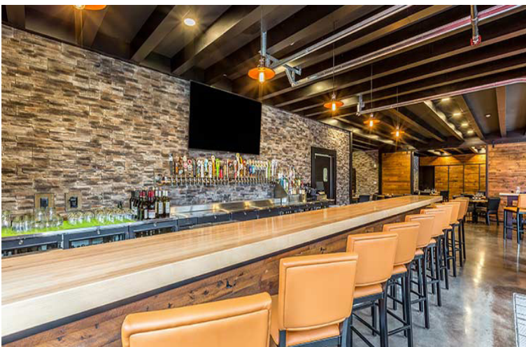
The bar at the Cobblestone Hotel & Suites

The Pablo Center at the Confluence, Eau Claire Grand opening plans are set for September for this $45 million arts center in the heart of downtown Eau Claire. Located at the confluence of the Eau Claire and Chippewa rivers, The Pablo Center, a shared university-community facility, will have large performance spaces, galleries, recording studios and the Visit Eau Claire experiential visitor and convention bureau tourism center.