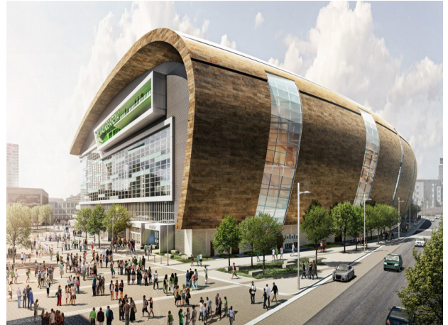
Wisconsin Sports and Entertainment Center Rendering

Wisconsin Entertainment and Sports Center, Milwaukee Scheduled to open late summer, the new $524 million Wisconsin Entertainment and Sports Center will be the new home of the Milwaukee Bucks NBA basketball team and a major catalyst for additional development downtown. It's located just a few blocks from the Wisconsin Center convention complex and major convention hotels.