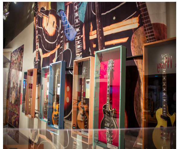
Les Paul Exhibit at Discovery World

Jazz guitarist Les Paul, father of the solid-body electric guitar, was born and raised in Waukesha. The characteristic sound and electric amplification that are the hallmark of rock and roll might never have happened without him. Milwaukee's Discovery World has a Les Paul's House of Sound exhibit where you can "play" a virtual jam session with the master himself, and see displays of more than 20 new guitars and never before seen memorabilia from his personal collection.