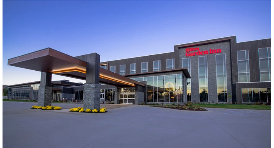
Hilton Garden Inn Wausau

Hilton Garden Inn, Wausau Custom designed to capture sweeping views of Rib Mountain State Park and Granite Peak Ski Area, the new Hilton Garden Inn has 7,800 square feet of premium conference space with capacity for 325 attendees plus an onsite restaurant.