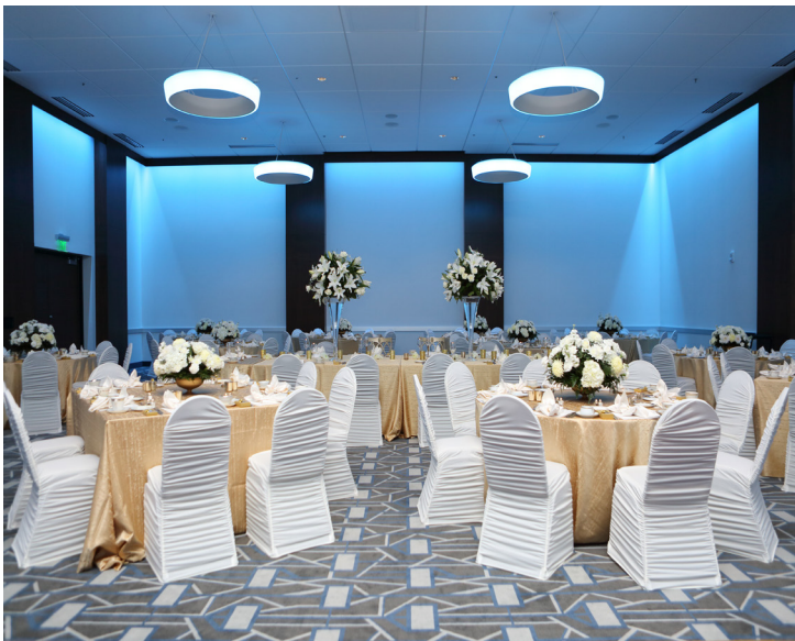
Radisson Hotel La Crosse's Renovated Ballroom

Kalahari Resorts & Conventions, Wisconsin Dells Known for its impressive waterparks, Kalahari Resorts in Wisconsin Dells has broken ground on a 112,000 square-foot expansion to its convention center, with a planned opening date of September 2019. This expansion nearly doubles the square footage for meetings and conventions and includes a new 52,000 square foot ballroom large enough to accommodate 8,600 attendees in theater-style seating.