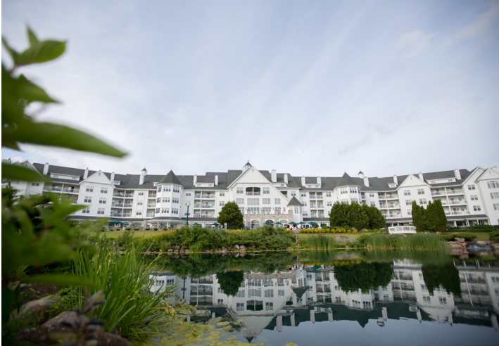
Osthoff Resort