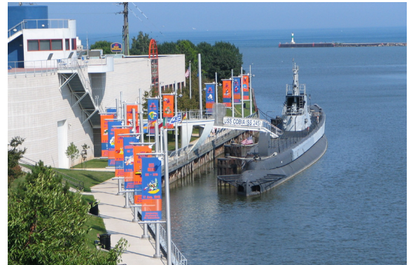
Wisconsin Maritime Museum

The Wisconsin Maritime Museum offers views of the Manitowoc River and the WWII Submarine, USS Cobia. Meeting spaces include a rooftop deck with a panoramic view of Lake Michigan, as well as three separate rooms suitable for meetings of up to 150 people.