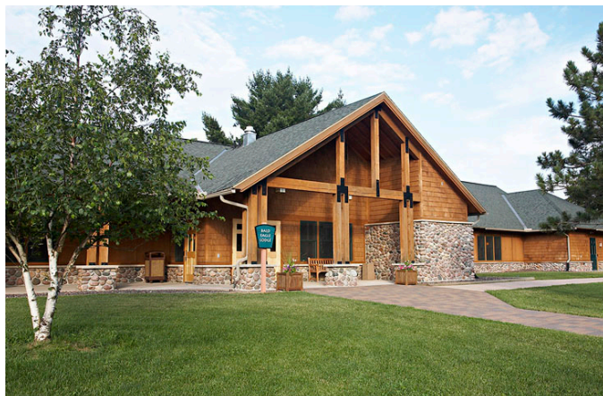
Heartwood Conference Center & Retreat

Door County Adventure Center offers several retreat options including teambuilding programs and workshops in Sturgeon Bay. They'll take you on kayak excursions, zip line adventures and rock climbing trips and can even customize a retreat.