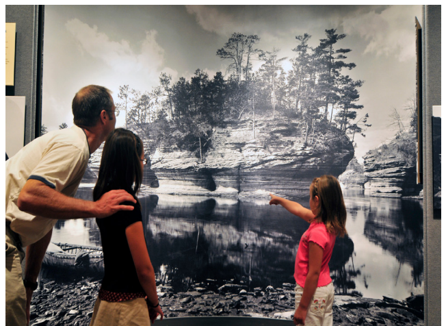
H.H. Bennett Museum Photo Courtesy Wisconsin Dells Convention and Visitors Bureau