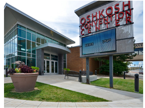
Oshkosh Convention Center

The Monona Terrace is designed for complete accessibility and civic enjoyment. Monona Terrace is a convention center like no other, rising from the blue expanse of Lake Monona and just two blocks from the State Capitol. Crowning this jewel is a 68,000-square-foot rooftop garden that celebrates the cityscape. The Alliant Energy Center, also in Madison, is a multi-venue complex featuring four unique and versatile venues for expositions, banquets, conventions, meetings, concerts, sporting events and much more.