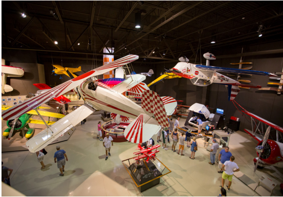
Airplanes inside the EAA AirVenture Museum

Meetings can be made more memorable by reserving a truly unexpected or out-of-the-ordinary meeting venue. These Wisconsin locales will certainly keep guests engaged.