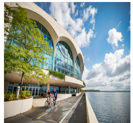
Monona Terrace