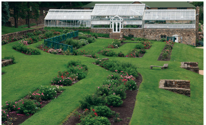
The Rose Garden at the Green Lake Conference Center

The Green lake Conference Center is a 900-acre retreat and conference center with a rural, natural setting on the serene shores of Wisconsin's deepest lake. Fifty meeting rooms provide 60,000 square feet of event and meeting space with another 30,000 square feet of outdoor space and more than 300 hotel rooms. Guests can relax after meetings by taking a walk through the facility's extensive rose garden.