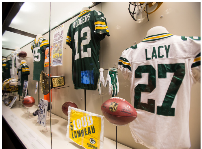
Green Bay Packers Hall of Fame at Lambeau Field