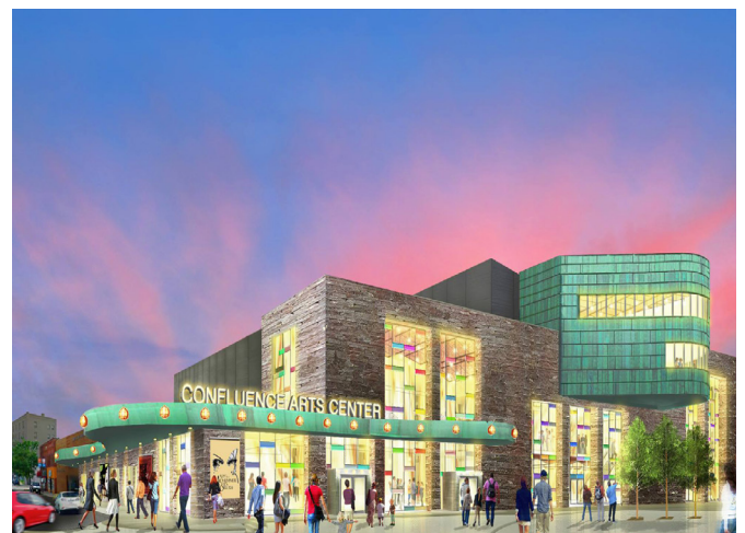
The Pablo Center at the Confluence Rendering