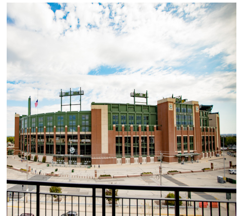
Lambeau Field